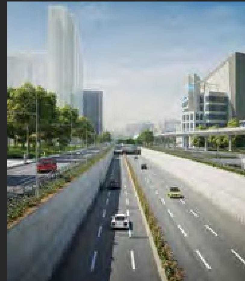
Artistic rendition of Ch. Raghvendra Singh Marg