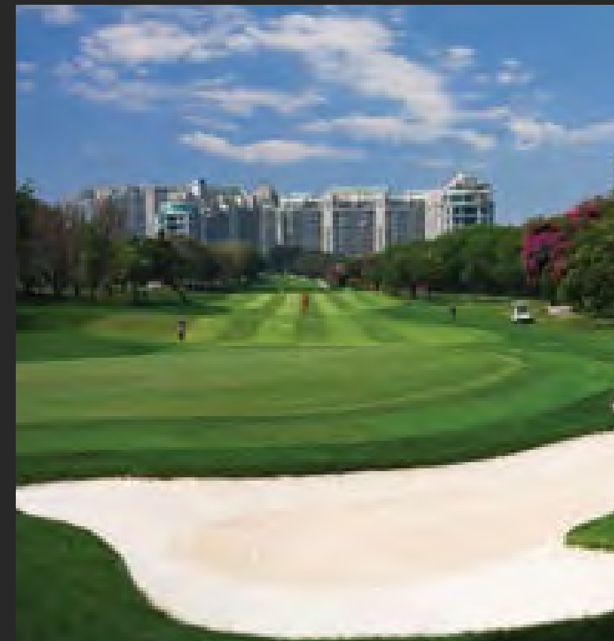
DLF Golf & Country Club