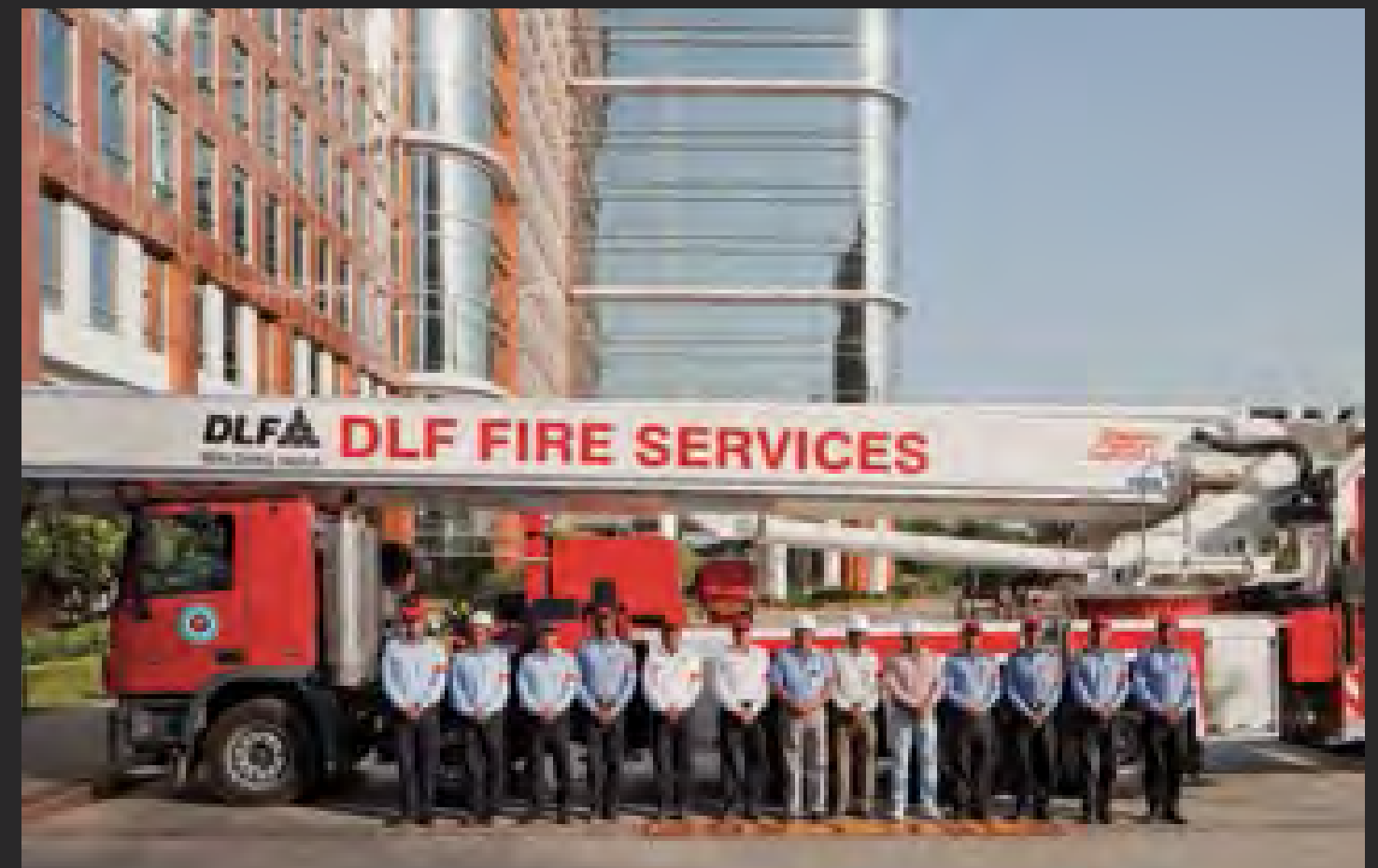
DLF Fire Services