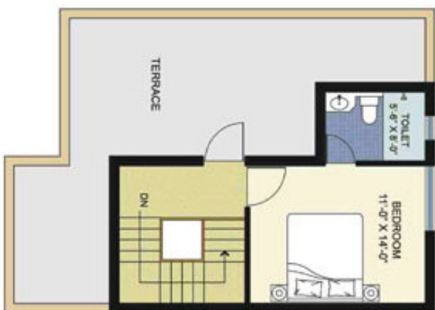
Second Floor Plan (Available in Option 2 only)